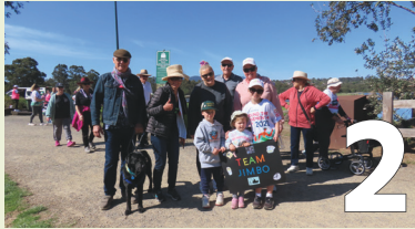
Pound the Pavement 4 EPC is back in 2025!