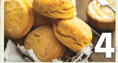
Legacy Recipe: Scones